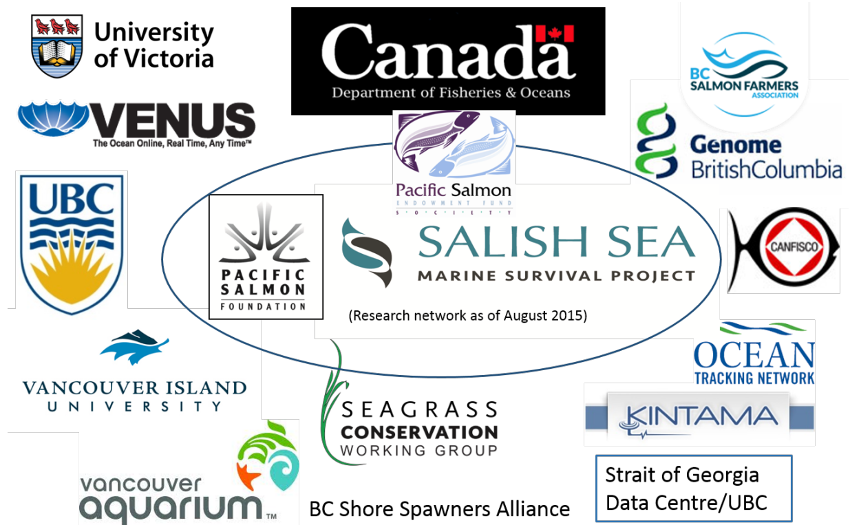
Figure 3. Research collaborations as of August 2015. This network representation does not include the numerous individuals and corporations that have enabled PSF to raise $8 Million in funds to support the SSMSP activities. Activities can be tracked at the SSMSP website:

www.marinesurvivalproject.com and at www.sogdatacentre.ca .